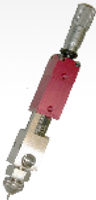
FCM100 NON CONTACT VALVE

POLY DISPENSING SYSTEMS S Y S T E M E S D E D O S A G E I N D U S T R I E L